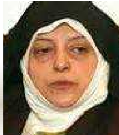
M. EBTEKAR Current VICE PRESIDENT OF IRAN 1997 – 2005 2013 – TODAY