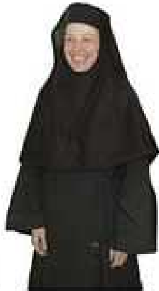
Orthodoxe Christelijke non