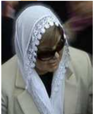
TANSU CILLER 30 th PRIME MINISTER Of Turkey 1993- 1997