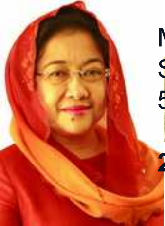
MEGAWATI SUKARNOPUTRI 5th PRESIDENT of Indonesia 2001 –2004