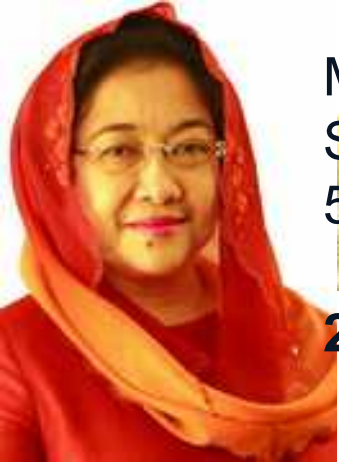
MEGAWATI SUKARNOPUTRI 5th PRESIDENT of Indonesia 2001 –2004