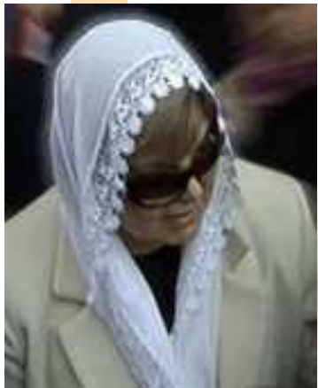
TANSU CILLER 30 th PRIME MINISTER Of Turkey 1993- 1997