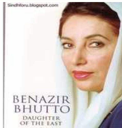
BENAZIR BHUTTO 11 th PRIME MINISTER Of Pakistan 1988-1990 AND 1993-1996