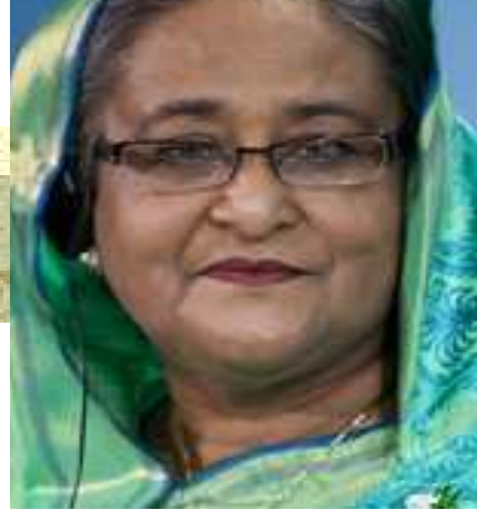
HASINA WAZED Bangladesh Prime Minister 1996 – 2001 2009 –TODAY