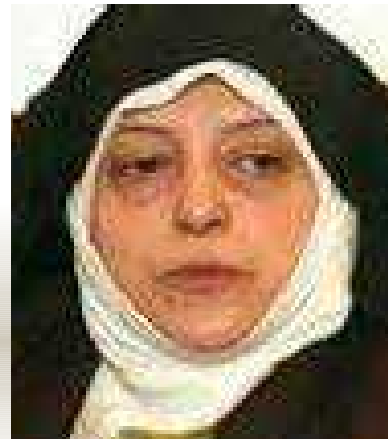
M. EBTEKAR Current VICE PRESIDENT OF IRAN 1997 – 2005 2013 – TODAY