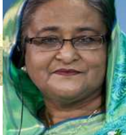
HASINA WAZED Bangladesh Prime Minister 1996 – 2001 2009 –TODAY