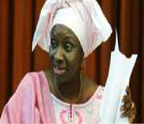
MAME MADIOR BOYE

Prime Minister Of Senegal MARCH 2001 – NOVEMBER 2002