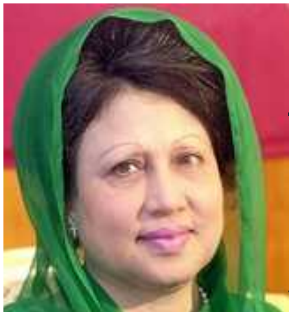
BEGUM KHALED ZIA Bangladesh PRIME MINISTER 1991-1996 & 2001-2006