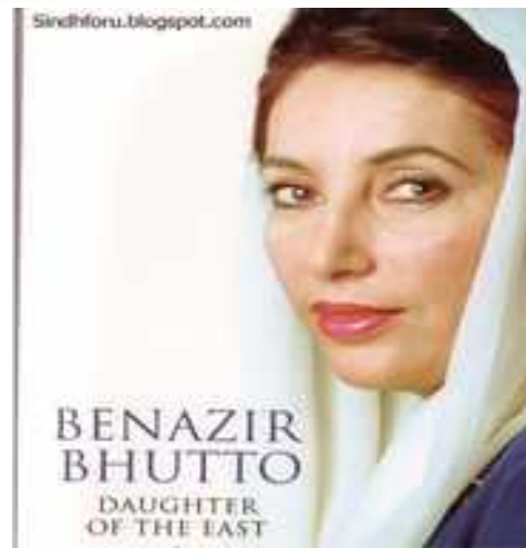
BENAZIR BHUTTO 11 th PRIME MINISTER Of Pakistan 1988-1990 AND 1993-1996