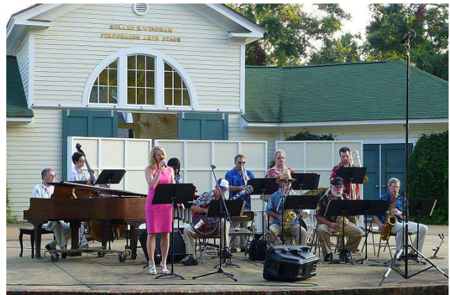
The eleven piece Southern Nights band plays on the Roland C. Windham Performing Arts Stage in Hopelands Gardens.