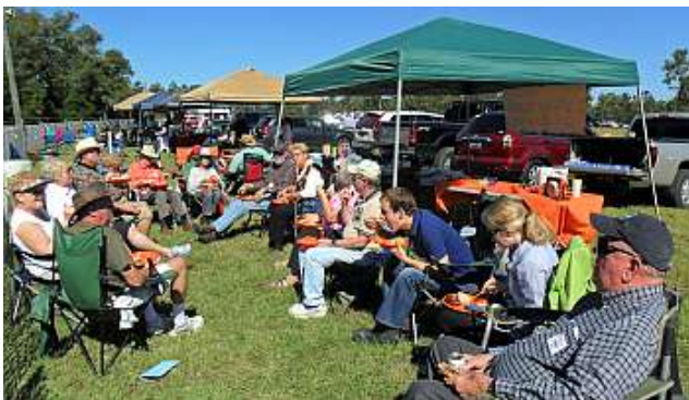
Two railside spaces provided plenty of room to enjoy the event.