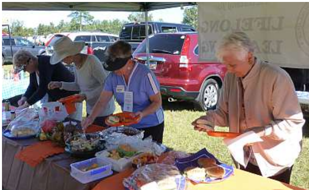
The chow line for shared dishes brought by the attendees.