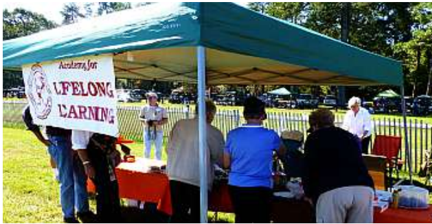
Our crack group of retired engineers finally had to resort to reading the directions to put up our canopy.

Hugo Z. Hackenbush* wasn't there but a bunch of Academy members were as we again held our annual event at the Aiken Fall Steeplechase, under dazzlingly blue October skies.