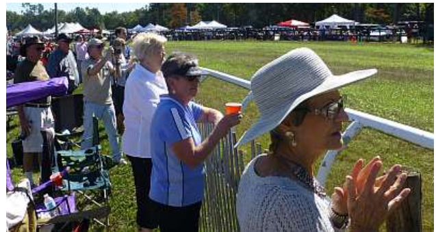
The group crowds to the rail to encourage their choice of horses.