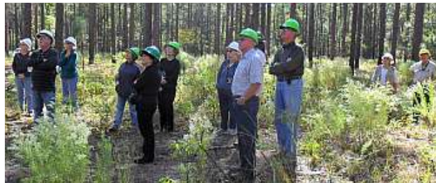
An Academy group watches as the USFS demonstrates the creation of a red cockaded woodpecker nesting site high in a long leaf pine.

The Forest Service encourages nesting by inserting man-made nesting boxes into holes cut into these trees.