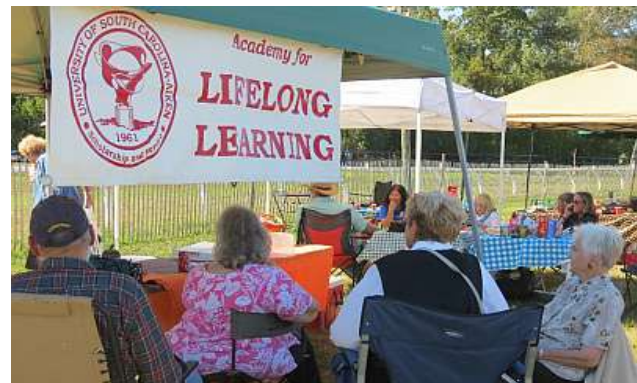
As the day progressed, the shade of our canopy became the preferred spot for some..

This is one of the events offered in the Fall Catalog. We'll be doing it again next year, why not join us?