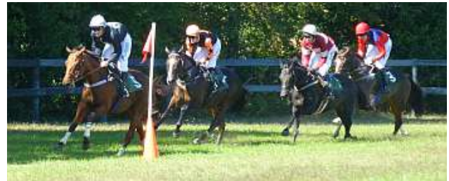
The party was occasionally interrupted by horses running by.