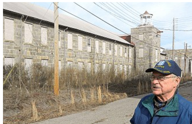
Graniteville Mill, closed in 2006, following the 2005 Graniteville train crash