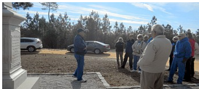
Grave of Cotton Mill Magnate William Gregg, "Father of the Southern Textile Industry"