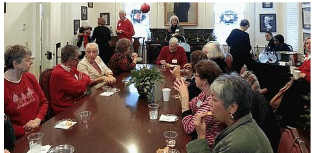
About 40 Academy members dropped by to enjoy delicious appetizers and Holiday beverages, and fellowship of other Academy members

The Academy held its third annual Holiday Reception December 4 at the Pickens Salley House on the USCA campus.