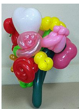
Sample balloon creations by Tom Brandner